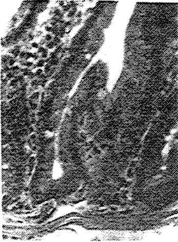
1. 0-Day. Almost normal structure. x 640

Histopathological changes observed in intestine included increased numbers of goblet cells in the villi and in the crypts, loosened muscular part, cytoplasmic degranulation and vacuolation, nuclear pyknosis, and abnormal mitoses. Lymphocytic infiltration was widespread in sub-mucosa and lamina propria. The lesions were observed by day 7 and continued up to day 30, being severe by day 15 (see Figures 1-4 below, photomicrographs of intestines).