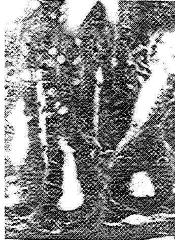
2. 7-day. Increased goblet cells, loosened muscular part, cytoplasmic changes. x 640