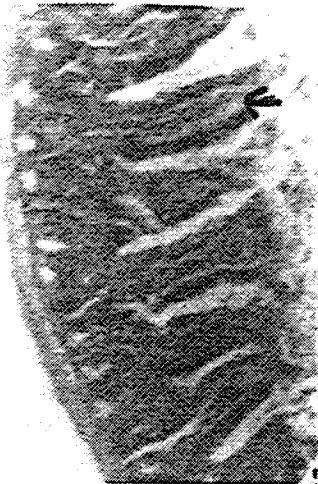
3. 15-day. Broken villi tips (arrow), cell debris in lumen. x 320