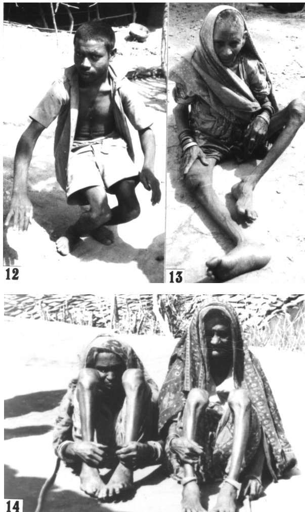
Figures 12-14. Cases of skeletal fluorosis showing secondary neurological complications: paraplegia and quadriplegia

X-rays of cervical spine (Figure 15), rib cage (Figure 16), lumbar-dorsal spine with pelvis (Figure 17), forearm (Figure 18), and lower limb (Figure 19) of 2-3 fluorotic subjects of each village showed increased bone mass and density as well as exostoses, calcification of ligaments and interosseous membranes, and osteosclerosis. These changes become more progressive with increase in age and F concentration in the water and provide further evidence of skeletal fluorosis in these villages. Other radiological changes have also been observed as described elsewhere. 27,28