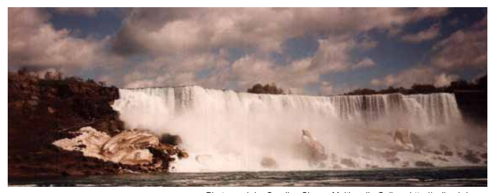
Figure 3. American Falls on the United States side of the river. Niagara Falls is composed of two major sections, Horseshoe Falls and American Falls, which are separated by Goat Island. A third part, the smaller Bridal Veil Falls, also is located on the American side, separated from the main falls by Luna Island. Niagara Falls was formed when glaciers receded at the end of the Wisconsin glaciation (the last ice age), and water from the newlyformed Great Lakes carved a path through the Niagara Escarpment en route to the Atlantic Ocean.

Figure 4. Just as it is sometimes hard to see the wood for the trees, on occasion it can be hard to see the falls for the water.