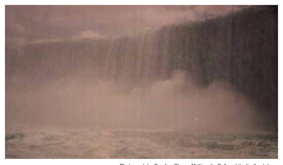
Figure 2. Horseshoe Falls, also known as the Canadian Falls, is a waterfall on the Niagara River, located on the Canadian side of the border with the United States.