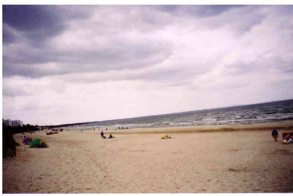
Baltic seacoast, Poland. Poland is bordered on the northwest by the Baltic Sea along a 524 km coastline.