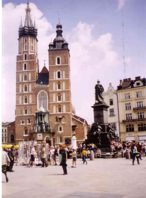
St Mary's Church in Kraków's Main Market Square is a brick Gothic church re-built in the 14th century to replace an earlier church built is the 1220s which was destroyed in Tatar raids. The church's altarpiece is a pentaptych, intricately carved in lime wood, painted, and gilded, with a central panel and two pairs of side wings that measures 13 m high and 11 m wide making it the largest piece of medieval art of its kind.