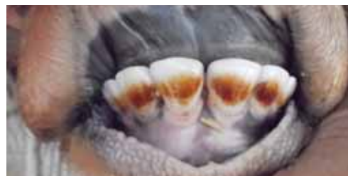
Figure 5. Severe form of dental fluorosis (deep yellowish coloration) in a calf.