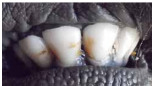
Figure 3. Mild form of dental fluorosis in a calf.

Dental fluorosis: Out of 24 calves and 75 cows, 10 calves (41.7%), and 28 cows (37.3%) exhibited various grades of fluorotic dental mottling. Their anterior teeth were bilaterally striated and were horizontally light to deep yellowish in colour (Figures 3–5).