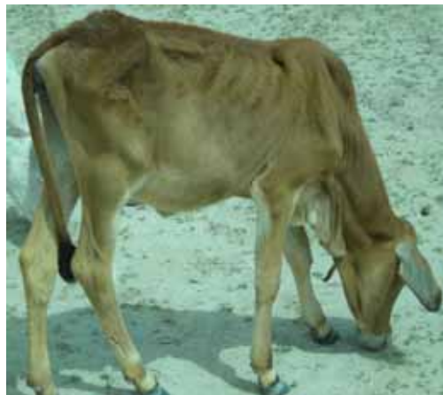
Figure 9. Emaciated <2-year-old calf afflicted with moderate skeletal fluorosis.

Skeletal fluorosis: Eight (33.3%) of the 24 calves and 30 (40.0%) of the 75 cows showed evidence of skeletal fluorosis. On careful examination and palpation of mandibular, scapular, tarsal, metatarsal, carpal, and cage regions of these animals, diffused to well-marked bony outgrowths (periosteal exostoses) were apparent (Figures 9–10). These animals were physically weak, indolent, and reluctant to move or stand. In these animals, mild to severe intermittent lameness and snapping sounds, especially in the hind legs, stiffness of leg tendons, and wasting of main mass of hind quarters and shoulder muscles were also observed.