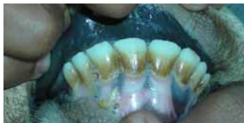
Figure 7. Moderate form of dental fluorosis in a calf.

In some calves, the dental staining was light brown to deep brownish or black (Figures 6–8). Generally, the staining in calves was more condensed, well stratified, and homogeneous, but in older cows it appeared in mosaic form. In severe form, irregular wearing of teeth and recession and swelling of gingiva were also observed. In older cows pronounced loss of tooth supporting alveolar bone with recession and bulging of gingiva and exposed cementum of incisor roots were common. Overall, the severity of dental mottling was more progressive with advancing age in the cattle.