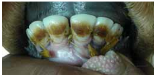
Figure 8. Severe form of dental fluorosis (deep brownish coloration) in a calf.

Skeletal fluorosis: Eight (33.3%) of the 24 calves and 30 (40.0%) of the 75 cows showed evidence of skeletal fluorosis. On careful examination and palpation of mandibular, scapular, tarsal, metatarsal, carpal, and cage regions of these animals, diffused to well-marked bony outgrowths (periosteal exostoses) were apparent (Figures 9–10). These animals were physically weak, indolent, and reluctant to move or stand. In these animals, mild to severe intermittent lameness and snapping sounds, especially in the hind legs, stiffness of leg tendons, and wasting of main mass of hind quarters and shoulder muscles were also observed.