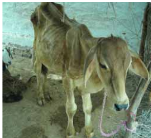
Figure 10. Emaciated <2-year-old calf afflicted with severe skeletal fluorosis. Note wasting of body muscles and bulging lesions on legs.

Other symptoms: According to the information given by the cattle owners and veterinarians, other signs of chronic F intoxication such as intermittent diarrhoea, colic, urticaria, and bloating were also present in the fluorosed animals. Among the cows, repeated abortions, stillbirths, and irregular estrous cycle were also