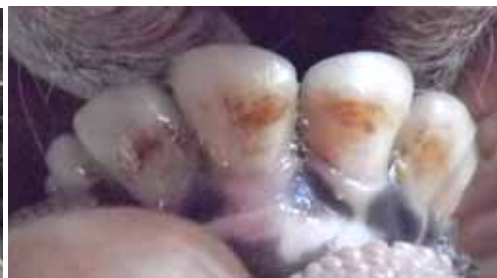
Figure 4. Moderate form of dental fluorosis in a calf.