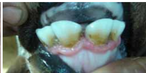
Figure 6. Mild form of dental fluorosis in a calf.